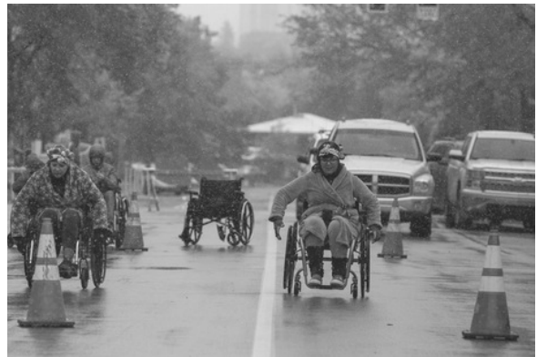
"Hot Rollers" wheel in the Saskatoon Wheelchair Relay September 2018