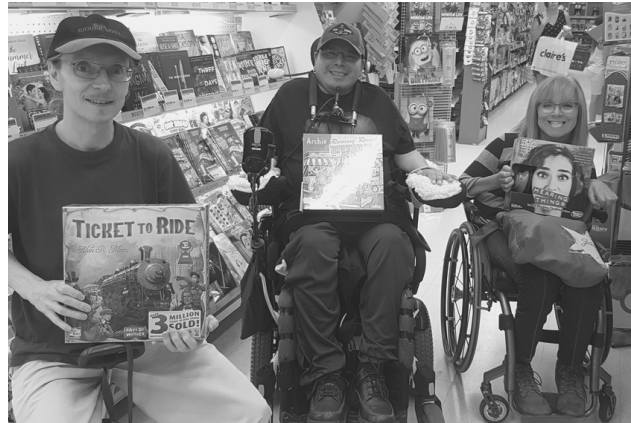
Saskatoon Peer Group enjoys a shopping excursion

SCI Sask believes peer engagement is vital to the well-being of all individuals. SCI SASK offered a number of initiatives in 2018-2019 to engage our clients in a variety of peer events, adapted activities and opportunities to promote positive lifestyle changes for individuals with physical disabilities.