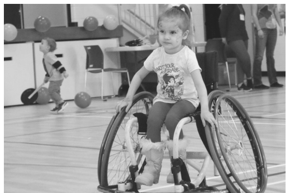
Never too young to learn about accessibility at the Regina Wheelchair Relay November 2018